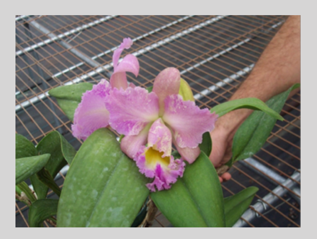
Color Break Virus on a Cattleya Orchid