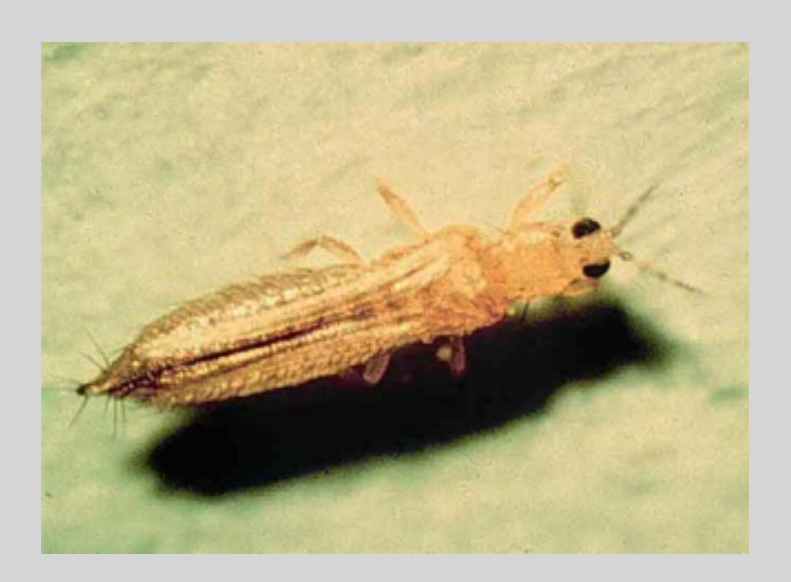
Trips, a piercing, sucking insect- difficult to eradicate