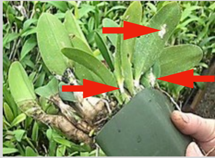
Boisduval scale on Cattleya pseudobulbs